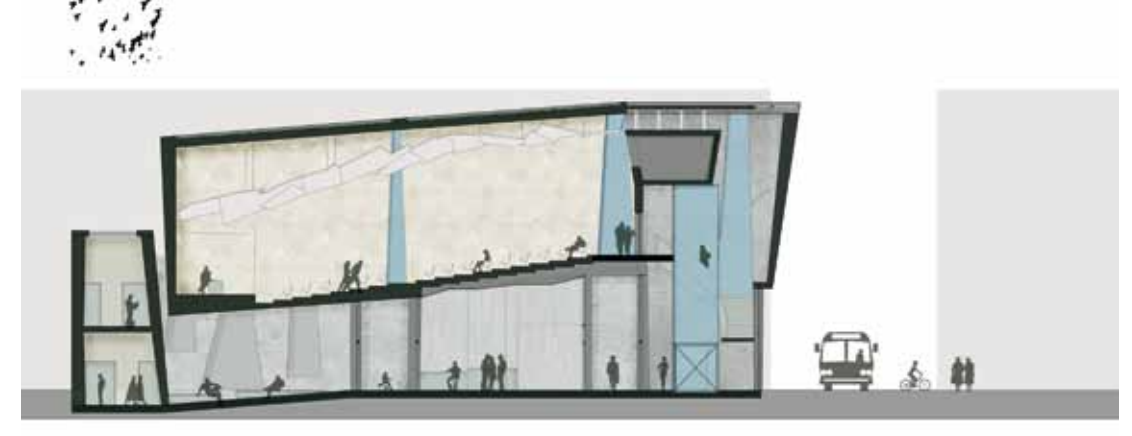
longitudinal section of the whole building, the slope in both levels leads to the focus of the Cultural Centre: the courtyard and the stage of the auditorium